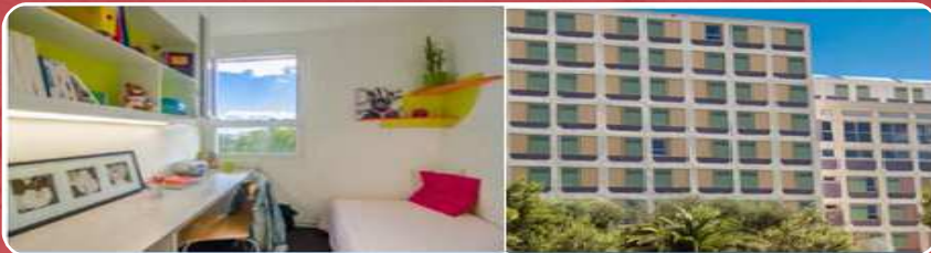
Résidence Saint Antoine